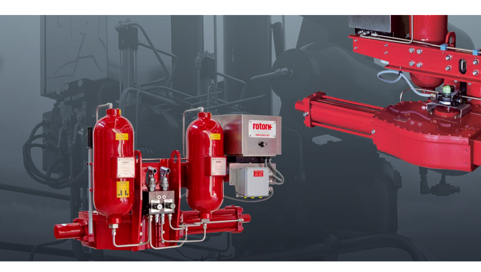
Gas-over-Oil valve actuators